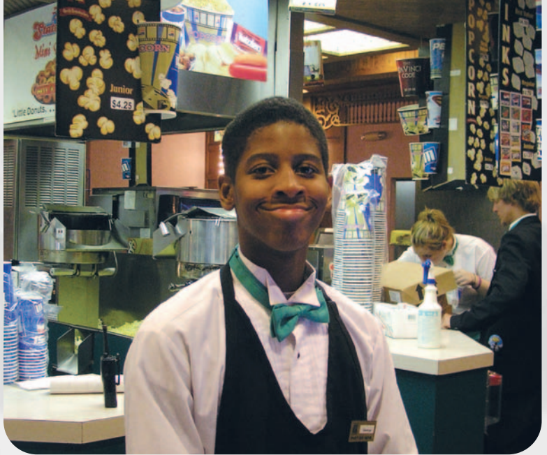
Common Wealth Development

P.O. Box 2337 Madison, WI 53701-2337 contact@womenofcolornetwork-wis.org www.womenofcolornetwork-wis.org