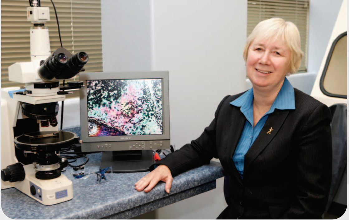
UW Small Business Development Center