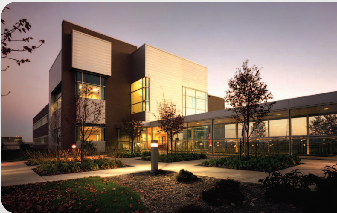
MGE Innovation Center

Alliant Energy offers free site location and project assistance services to companies interested in expanding or relocating in our utility service territory which includes Dane County. Our team of economic development professionals offers site and building evaluations, research and information services, site visit coordination, liaison with local communities and cost-saving energy-related programs and services. The Economic and Community Development Department also offers Partnership Programs that include grants to communities for marketing materials, workforce development projects, professional development and regional partnership support.