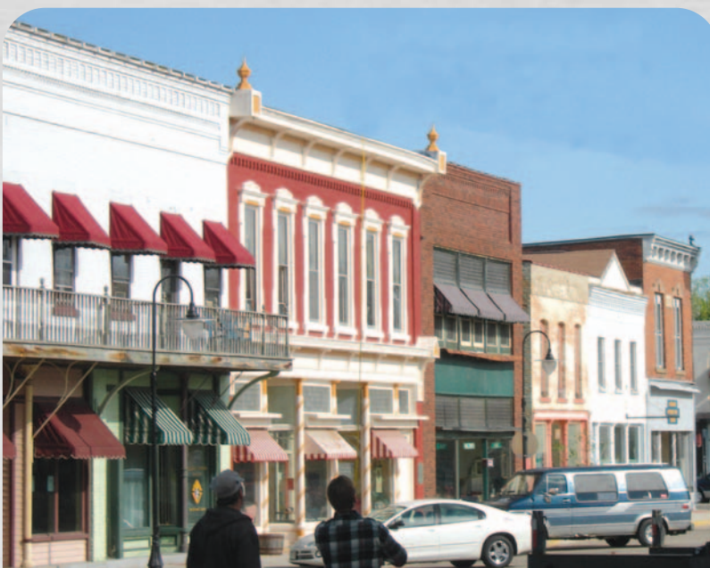
Village of Mazomanie