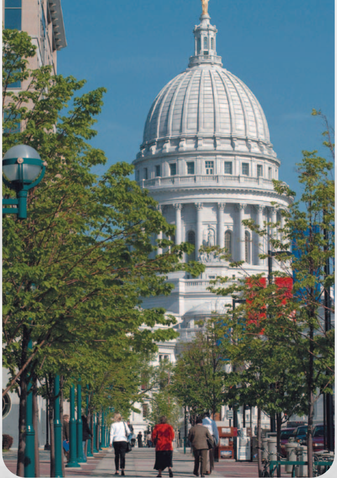
Greater Madison Convention and Visitors Bureau