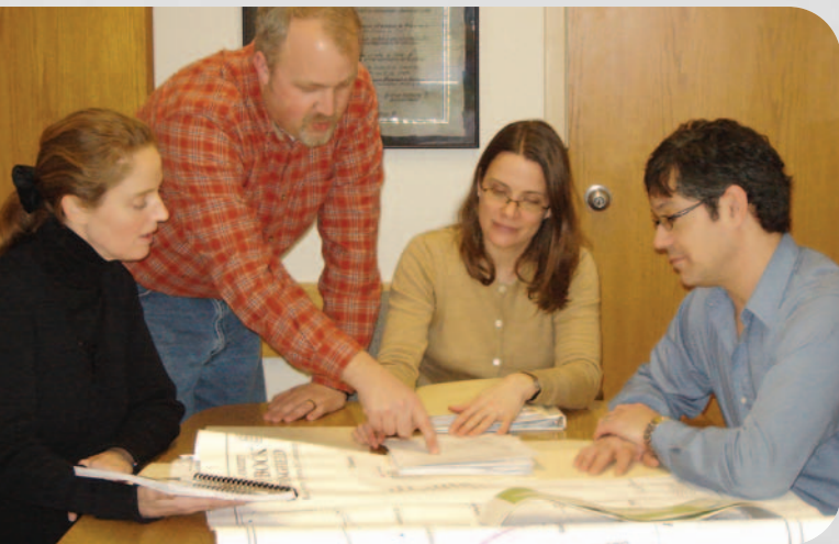
Dane County Planning and Development Department

The following entities provide support to communities and organizations in Dane County that are currently pursuing, or interested in pursuing economic development opportunities.