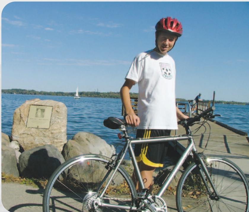
Governor Nelson State Park