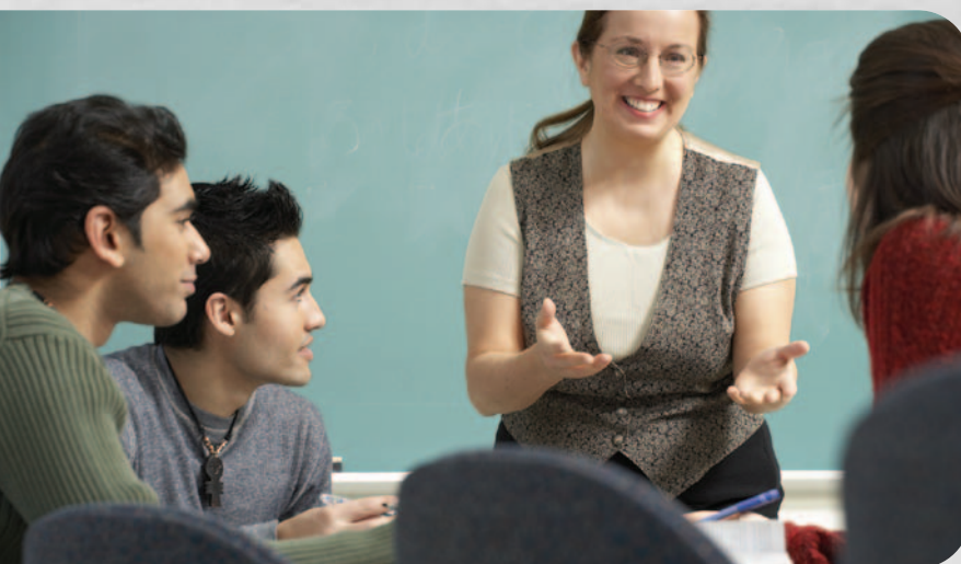
Workforce Development Board of South Central Wisconsin