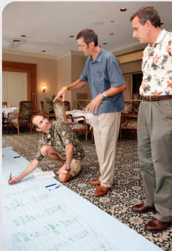
UW Small Business Development Center

For public or private entities with road, rail, harbor and airport projects that promote development and attract and retain businesses. For more information, visit: www.dot.wisconsin.gov/localgov/aid/tea.htm