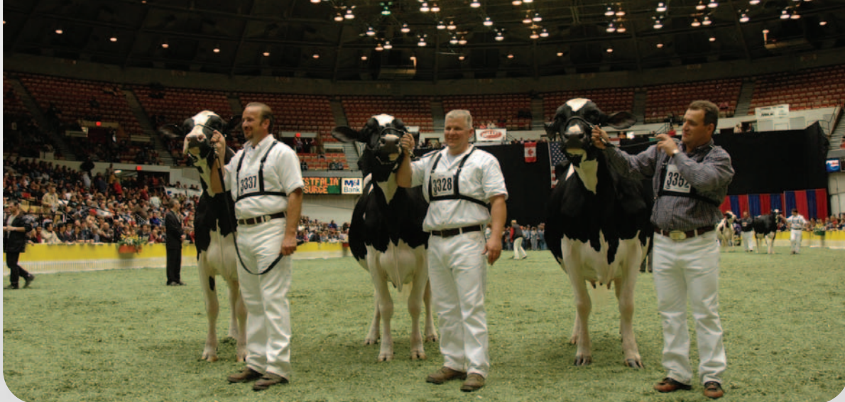
World Dairy Expo, 2006