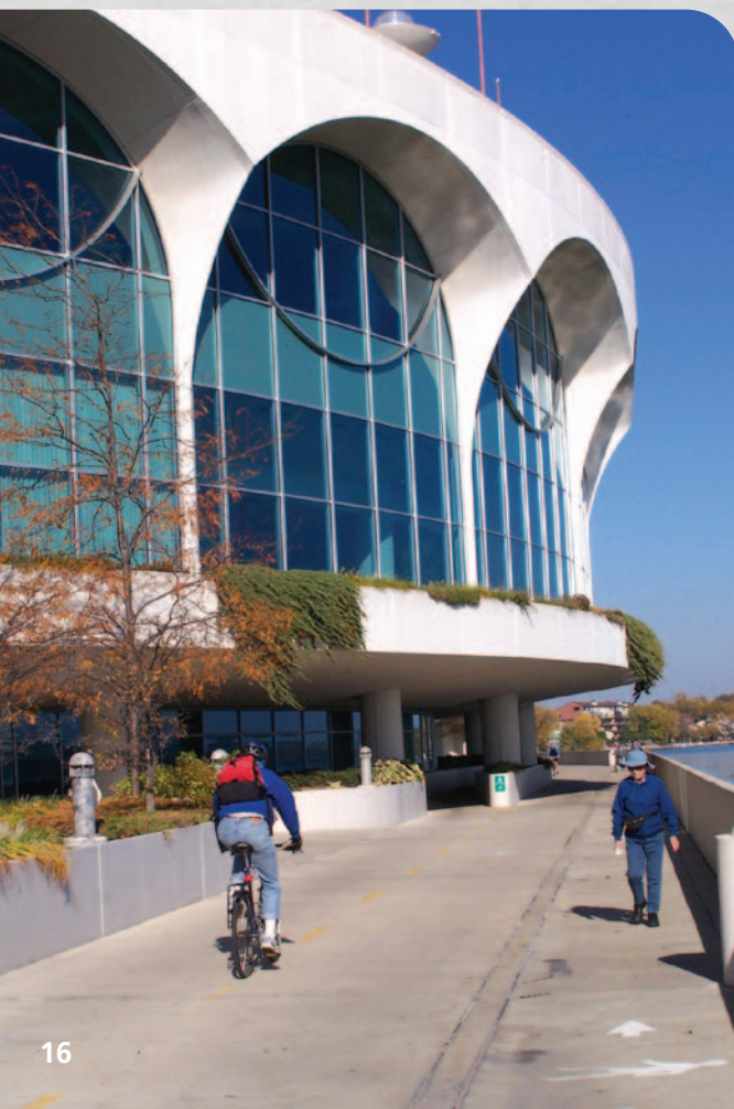
Monona Terrace Convention Center